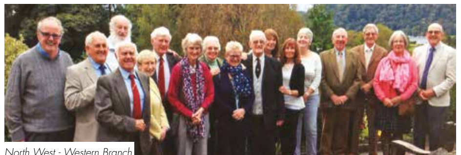
North West - Western Branch

Contact: Norman Waterfall ☎ 01829 270 095 ✉ normanwaterfall@talktalk.net