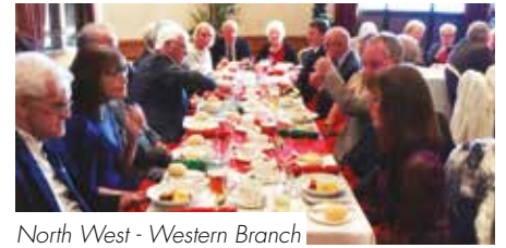
North West - Western Branch